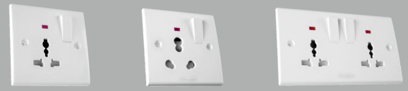
10001-WH 10002-WH 10003-WH