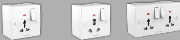
10004-WH 10005-WH 10006-WH