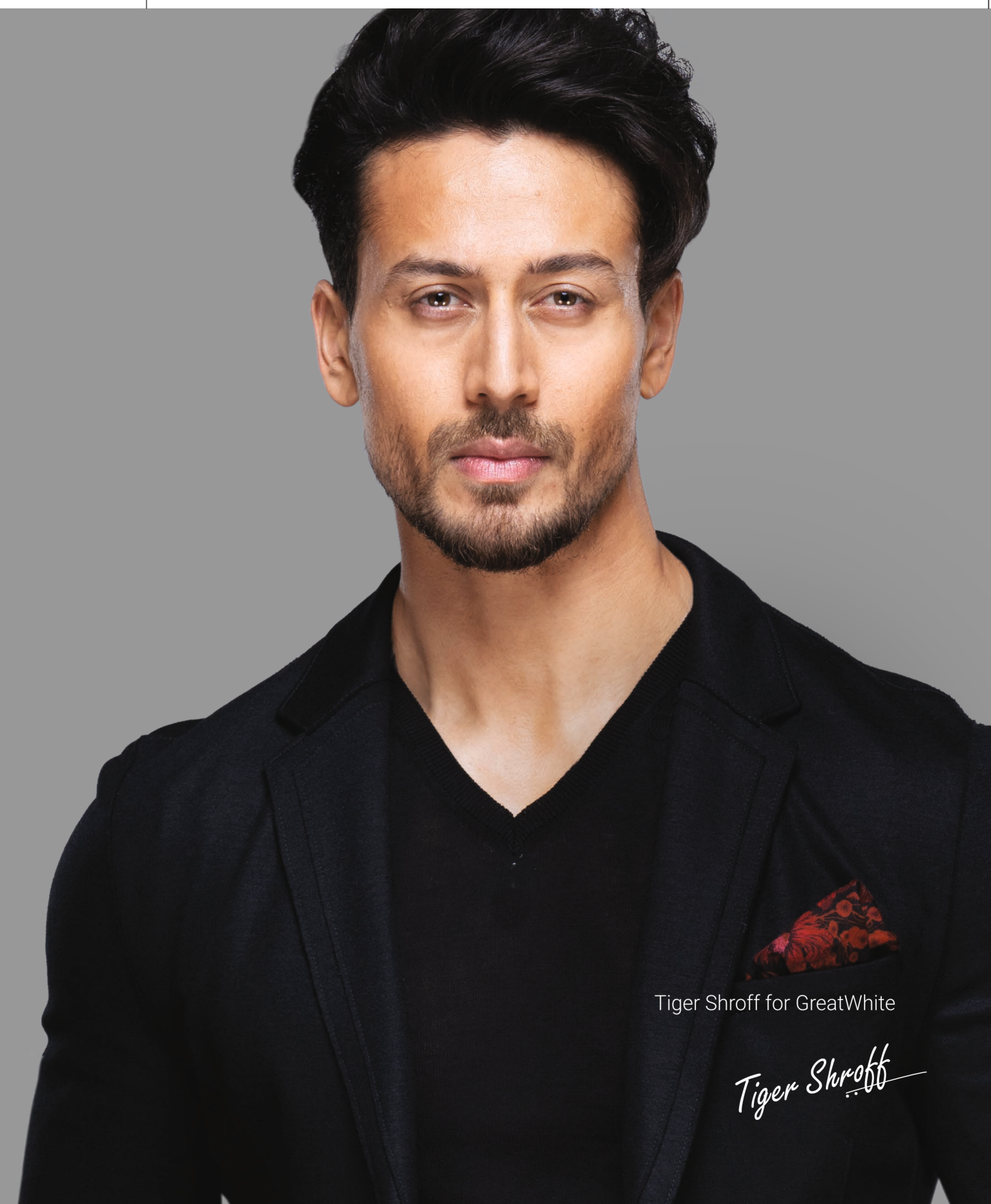
Tiger Shroff for GreatWhite

I welcome you to this journey of luxury indeed to a journey of Great.